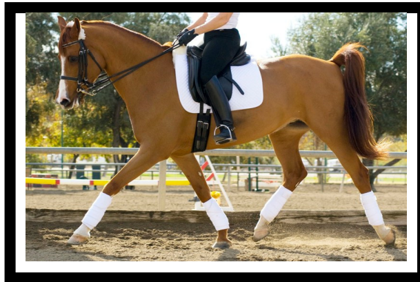
At The Hansen Dam Equestrian Center 11127 Orcas Street, LVT, CA 91342